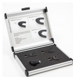
Spine applicator set