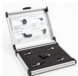
Fascia applicator set